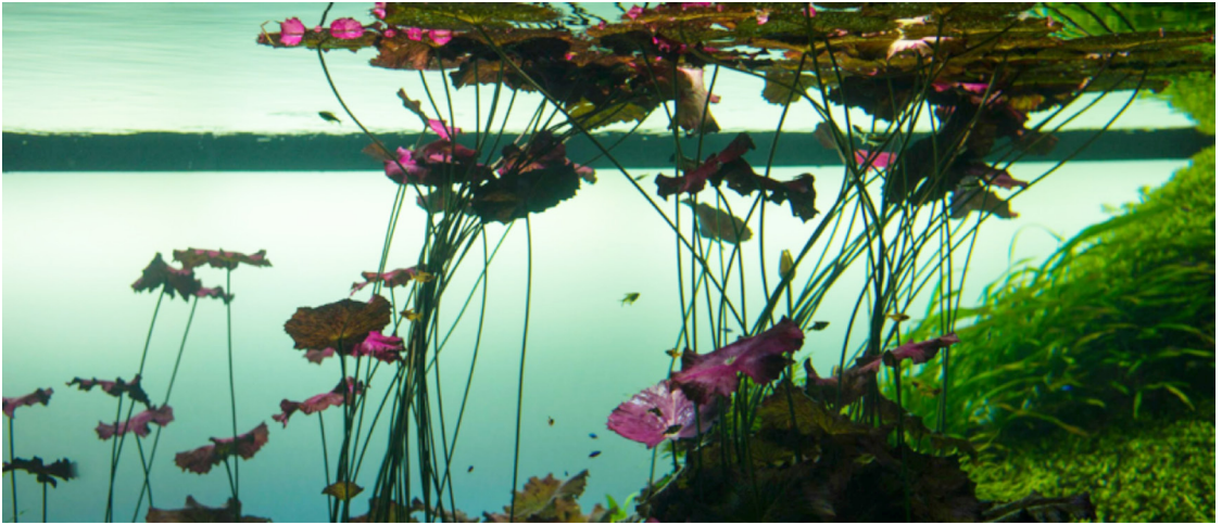
Figure 4. Stillness (2016)