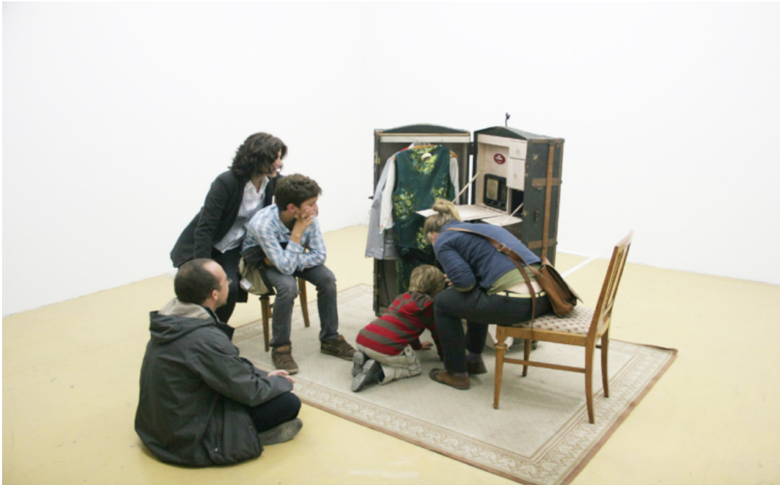
Figure 5. Unattended Luggage (2012)

In Godsheide Futures (FoAM, 2015), where we looked at possible futures for shared public spaces in a Belgian residential neighbourhood, fragments of scenarios were experienced as part of a reception. While visitors engaged in the usual mingling and networking, the scenarios began to enter their conversations via finger-foods and aperitifs. Translating scenarios into “edible futures” (FoAM, 2014) created an informal atmosphere that encouraged conversation between policy makers, urban planners and the inhabitants. Over food and drinks, almost imperceptibly, the first commitments were made to bring some of the scenarios into reality. A year after the reception, the inhabitants have successfully repurposed a local church into a community-supported school and plans are underway to form a co-operative for more ambitious projects.