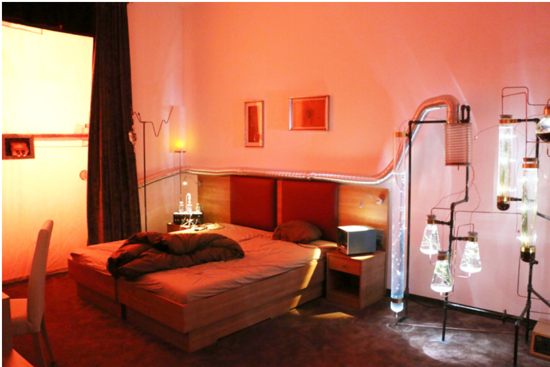
Figure 3. Lucid Peninsula (2014)

In Lucid Peninsula (Time's Up, 2014) (Figure 3), visitors find themselves in a hotel room, in a future where pollution and environmental degradation have led to peculiar developments in medical and consciousness technologies. An airtight window is fitted with the OrganoClean air purification system, the room breathing mechanically, as the air bubbles past plants growing in oversized test tubes. The buzzing of a detox shower can be heard through the locked bathroom door. Clothing items are tagged as having been decontaminated. The bed is flanked with a General Infection Negation blood cleansing device and a DreamNet system for “sharing dreams with friends and colleagues.” Upon entering the room, visitors are absorbed in the hypnotic breathing rhythms; many lie on the bed with their eyes closed, while others pensively investigate the copper-tubed breathing apparatus and brass window viewer, showing an overlay rendering of the outside world.