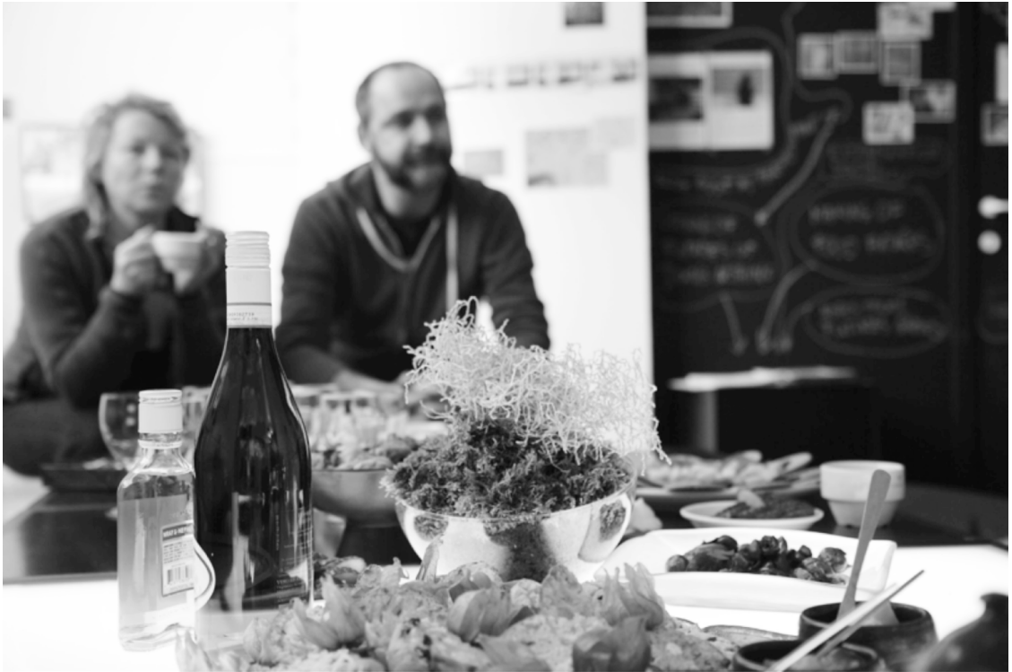
Figure 6. Godsheide Apero (2015)

By “holding space” (Corrigan, 2006) and informally engaging with the visitors, we do not leave people “hanging” after experiencing (sometimes disturbing) futures. If we are interested in experiential futures affecting thoughts and behaviours in the present (Ramos, 2005; Inayatullah, 2004) hosting the visitors’ conversations and reflection is as important as creating a compelling futures narrative. Such (strategic) conversation allows the experiential insights to echo in the visitor’s work and life, raising ambient awareness of possible future repercussions (Chermack, Lynham, & Ruona, 2001; Gidley, Fien, Smith, Thomsen, & Smith, 2009; Haraway, 2016). This implies moving away from consuming futures as entertaining speculative fiction and towards a more widespread futures literacy (Candy, 2010; Miller, 2011).