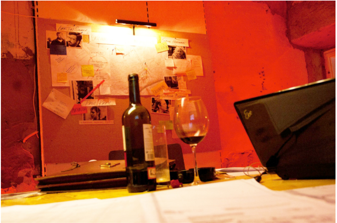
Figure 2. Stored in a Bank Vault (2011)

In Stored in a Bank Vault (Time's Up, 2011) (Figure 2), visitors take on the role of a detective, stumbling into the underground lair of a group about to rob a nearby bank vault. As visitors inspect the basement, they uncover various aspects of the story — in hacked computers, tapped surveillance cameras, architectural plans, sedatives, by overhearing a character's phone conversation behind a locked door, or chancing on a plan of attack. Dedicated investigators discover that the heist may not be just about cash, but some enigmatic seeds. They may find a trail of the group's previous exploits that reveal deeper layers of motivation. Like in a good thriller, this leads to surprises and unexpected plot-twists, seducing the visitors to delve deeper into the story.